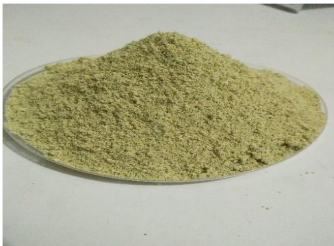
Fig 2: picture of formulated premix

Out of four trials that were carried out, 4 th trial was taken ahead to formulate the product as it was appropriate and was meeting the expectations.