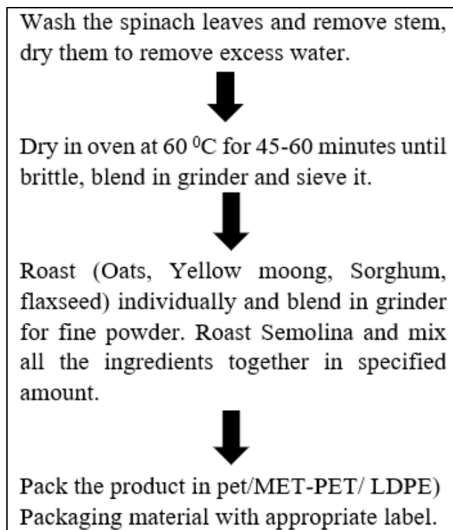
Fig 1: flowchart for standard preparation of premix