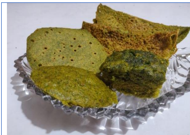
Fig 3: picture of food items that can be made using premix i.e. idli, dosa, utthapa and dhokla