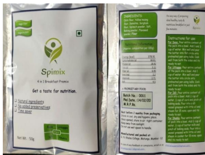
Fig 5: Picture of front and back label