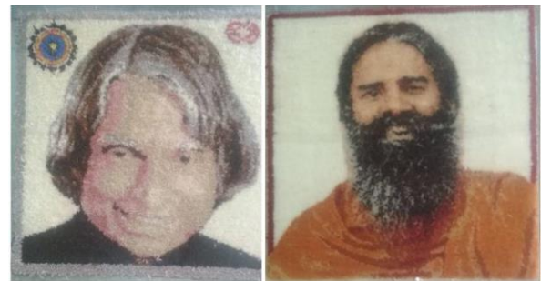
Fig 4: Prepared spitting images (a) DR APJ Abdul Kalam (b) Baba Ramdev