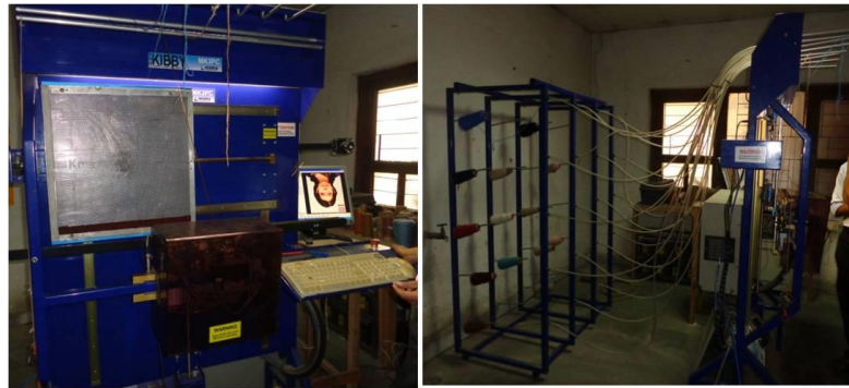
Fig 1: Kibby Machine used to prepare wall carpet with spitting images (a) Front view (b) Back view

machine also included the ability to inputs simple designs and repeats without the use of the CAD system.