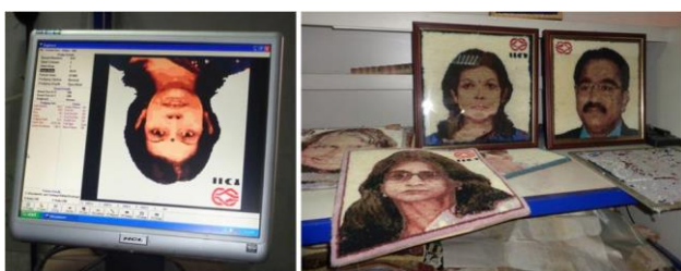
Fig 3: Spitting images attached with carpet machine (a) Spitting images in computer (b) Prepared spitting images

The Kibby Carpet Sampling Machine provides the flexible and quick response required to meet the exacting design and production requirements of carpet manufacturers today. Some of the prepared spitting images are shown in Fig 3 and Fig 4.