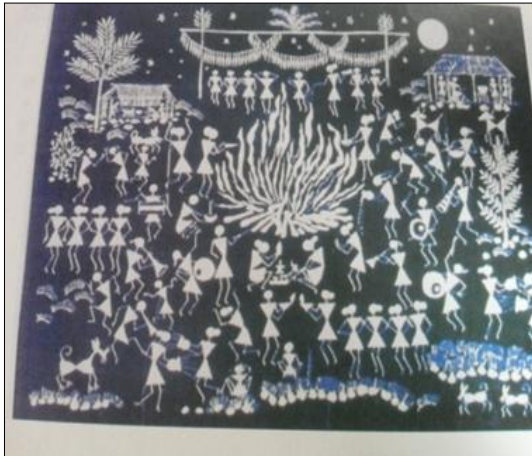
Plate No 8.8: Festival Holi

Holi festival is the New year celebration of Maharashtra people mainly celebrated in the month of March.