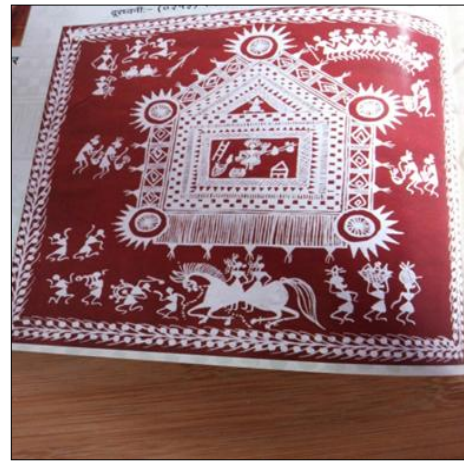
Plate No 8.2A: Lagnchowk