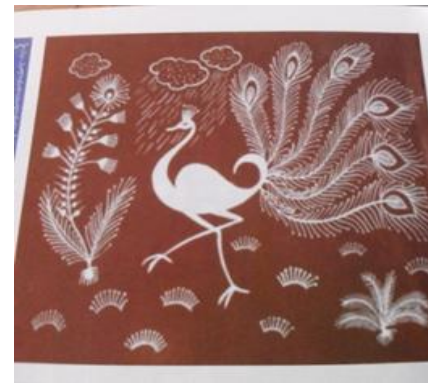
Plate No 8.6B: Peacock Motif