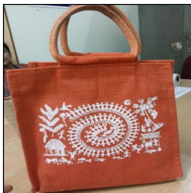
Plate No 12: Warli on Bags