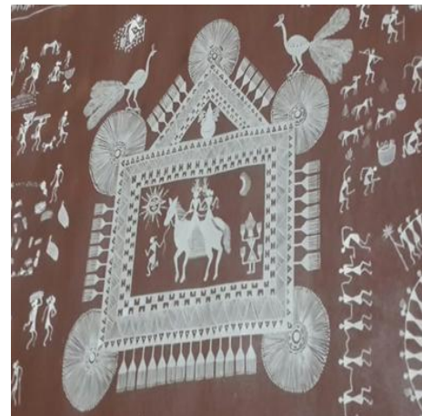
Plate No 8.2B: Lagnchowk