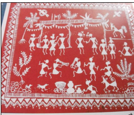
Plate No 9B: Marriage Ceremony Bridegroom