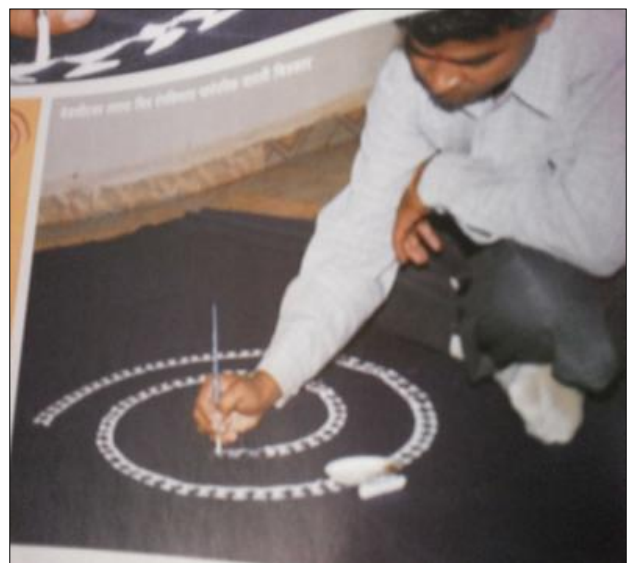
Plate No 1: Painting Technique

Warli painting is an emblematic expression of day-to-day experiences and beliefs. As such, symbolism, simplicity and beauty hold them together in a single school of traditional art.