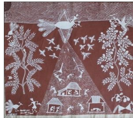
Plate No 8.6C: Hunting scene with Birds flying in the sky, Horse, Butterfly