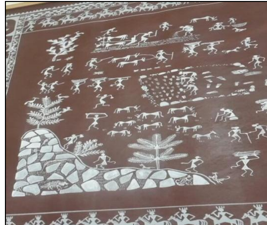
Plate No 8.10: Reaping Season Motif

adaptations in warli art include bicycles & transistors as well apart from flora and fauna. Musicians and agriculture being the traditional one.