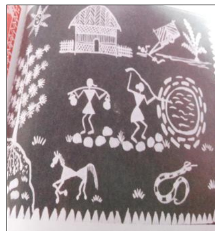
Plate No 8.7: Snake Motif

As warlis are farmers, animal motifs like Cows, Bulls, Cocks, Hens, Sheep's, dogs are used in painting as these are domestic animals. Bird motifs like Peacock, sparrow are seen sometimes snake, frog is also seen. Peacock is a national beautiful bird depicted every where in traditional textiles, embroideries and paintings in India. Frogs are depicted for heavy rainfall, Scene of harvesting or farming is shown to grow grains in ample amount and prosperity.