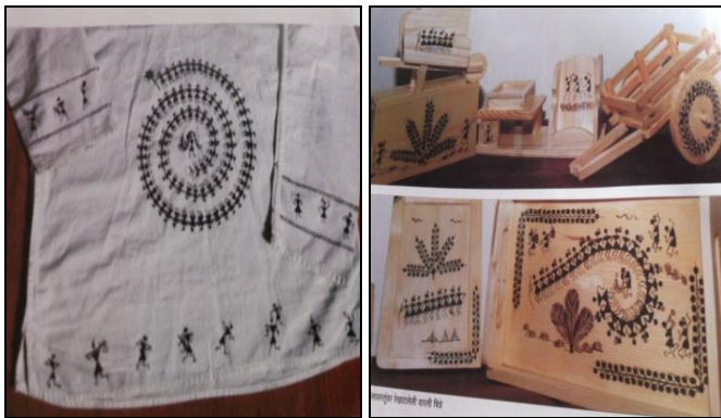
Plate No 11: Warli on Top and Household articles

Warli paintings are today a very popular fashion motif, with designers frequently using them to create fashionable saris, shirts, skirts, salwar kameez, shawls, stoles, tunics, kurtas and kurtis. The paintings can be either directly painted on the fabric or printed on it. Usually clothes with warli paintings are made of materials like raw silk and cotton which hold color easily. The stiffness of raw silk is preferred as it creates the perfect canvas to showcase Warli designs. They are either arranged in bold patterns all over the fabrics or restricted to the border areas.