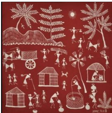
Plate No 8.4: Human Figures in day to day activity

The central motif in these ritual paintings is surrounded by scenes portraying, hunting, fishing, & farming, festivals & dance, Human figures are represented by two triangles joined at the tip: the upper triangle depicts the trunk & the lower triangle the pelvis. Circle depicts the face without features like nose, eyes and ears. Males are identified from bunch of hair is shown and females with special hairstyle in circle called "Ambada".