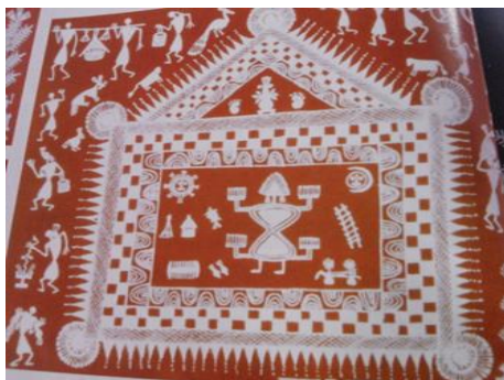
Plate No 8.1: Devchawk

The lines are drawn on name of bride and bridegroom. In this motif, bride and bridegroom riding horse is depicted in the center of square. This motif is painted mainly by married women by performing rituals. Remaining part of it is painted with various motifs by women from their families and boys and girls with cheerful gestures, a sort of group painting.