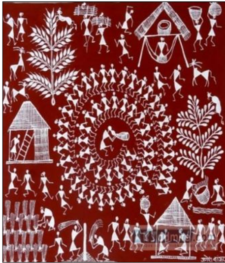
Plate No 8.3B: Tarpa Dance Motif