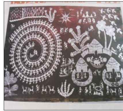
Plate No 8.6A: Birds and Animals