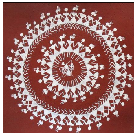
Plate No 8.3A: Tarpa Dance Motif

Tarpa dance is a folk dance of warli tribe. Tarpa is a musical instrument of these tribe. "Tarpa" is made of dry bottlegourd, bamboo tubes and bamboo sticks, cord and wax. This instrument is beautiful looking and 2 feet to 6 feet in length. This dance is performed in circle by male and females by holding hands of each other's and clasping. Main Dance performer standing in center plays instrument Tarpa and Females get involved in this performance with free mind. This dance is started at the time of sunset and performed till sunrise of next day. So sun and moon motifs are seen in this painting. Sometimes boys and girls, they select their dance partner as life partner too through tarpa.