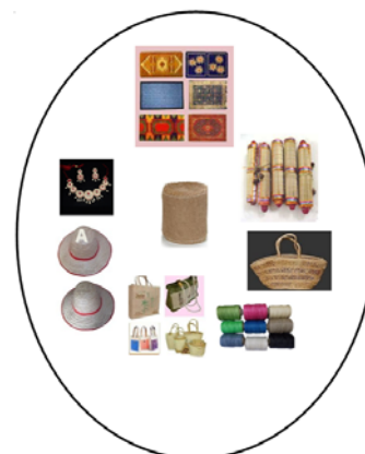
Fig 1: Different articles made of jute fibres

yarn wrapped with polypropylene multifilament and concluded that jute fibres could be a better substitute for synthetic fibres used to manufacture such products [11].